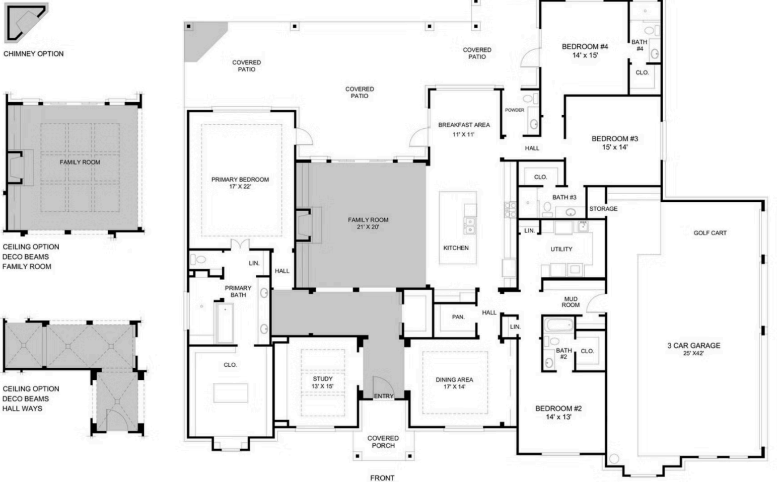
PLAN VIEW OPTIONS

All square footage is approximate. Renderings are artist's conceptions and may vary slightly from the actual home. Homes may be built in reverse of plans shown, depending on site conditions. Minor architectural changes may be made occasionally at the option of the builder. Please contact your Sales Consultant for details.