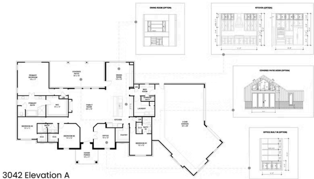
3042 Elevation A

All square footage is approximate. Renderings are artist's conceptions and may vary slightly from the actual home. Homes may be built in reverse of plans shown, depending on site conditions. Minor architectural changes may be made occasionally at the option of the builder. Please contact your Sales Consultant for details.