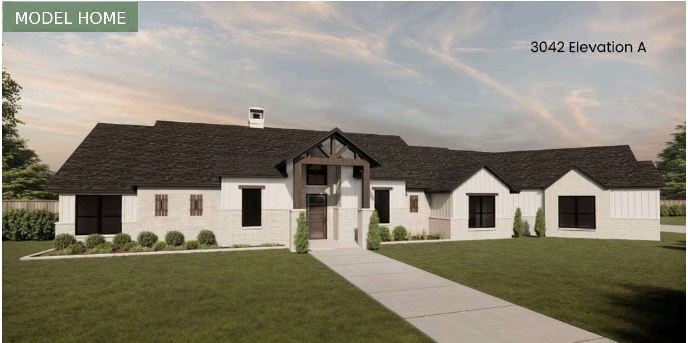
3042 Elevation A