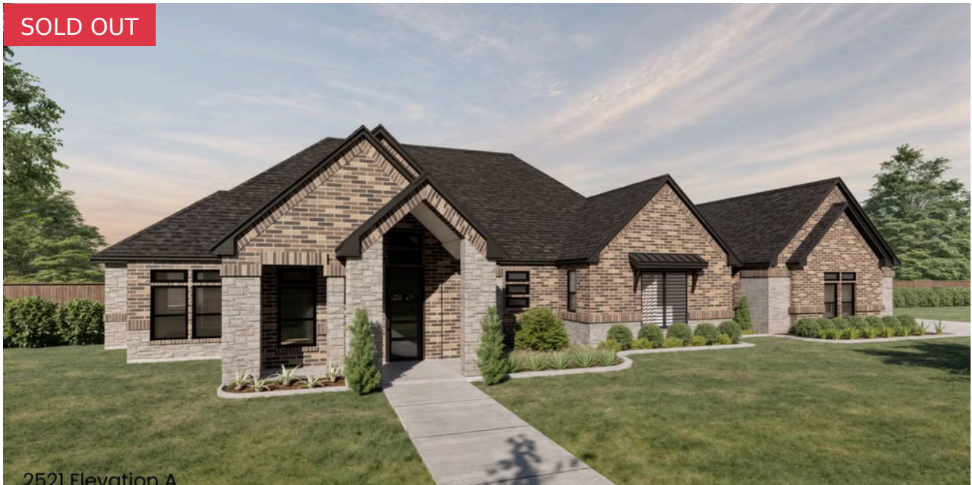
2521 Elevation A