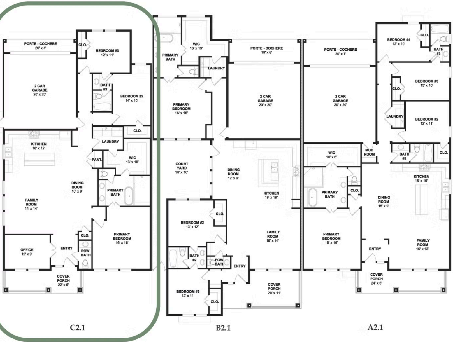
Elevation C 1991 Building D

All square footage is approximate. Renderings are artist's conceptions and may vary slightly from the actual home. Homes may be built in reverse of plans shown, depending on site conditions. Minor architectural changes may be made occasionally at the option of the builder. Please contact your Sales Consultant for details.