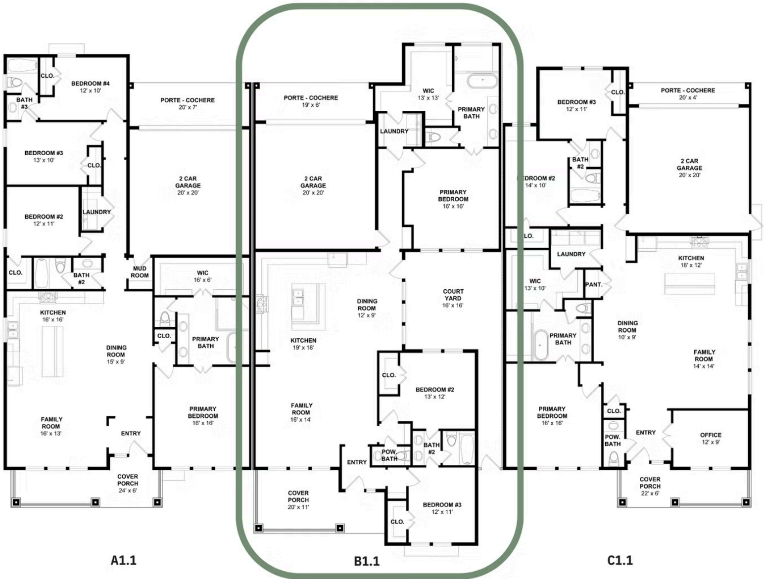
Elevation B 1944 Building A, B, C

All square footage is approximate. Renderings are artist's conceptions and may vary slightly from the actual home. Homes may be built in reverse of plans shown, depending on site conditions. Minor architectural changes may be made occasionally at the option of the builder. Please contact your Sales Consultant for details.