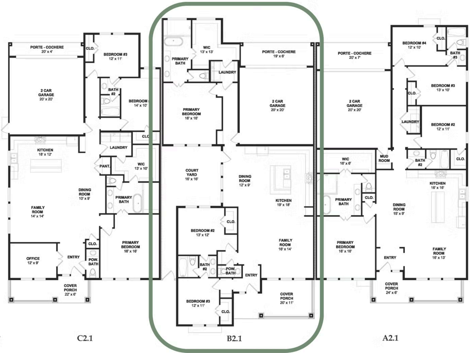
Elevation B 1944 Building D

All square footage is approximate. Renderings are artist's conceptions and may vary slightly from the actual home. Homes may be built in reverse of plans shown, depending on site conditions. Minor architectural changes may be made occasionally at the option of the builder. Please contact your Sales Consultant for details.