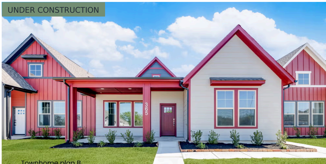
Townhome plan B