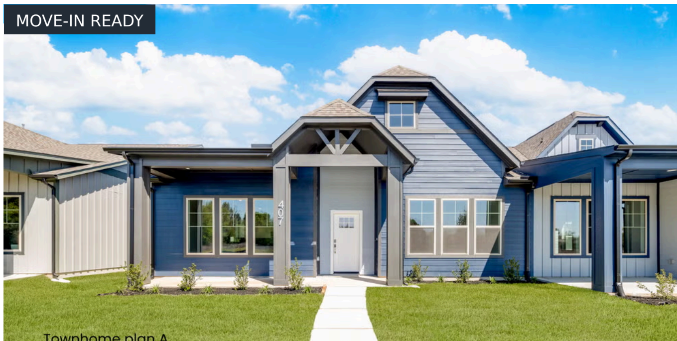
Townhome plan A