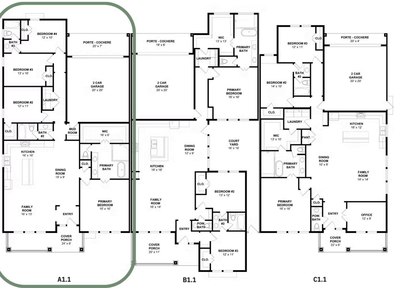
Elevation A 2002 Building A, B, C

All square footage is approximate. Renderings are artist's conceptions and may vary slightly from the actual home. Homes may be built in reverse of plans shown, depending on site conditions. Minor architectural changes may be made occasionally at the option of the builder. Please contact your Sales Consultant for details.