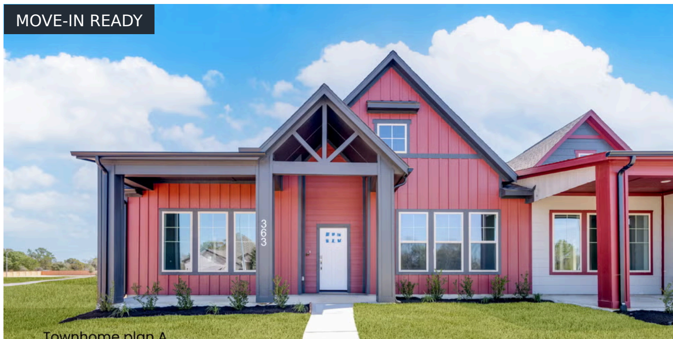
Townhome plan A