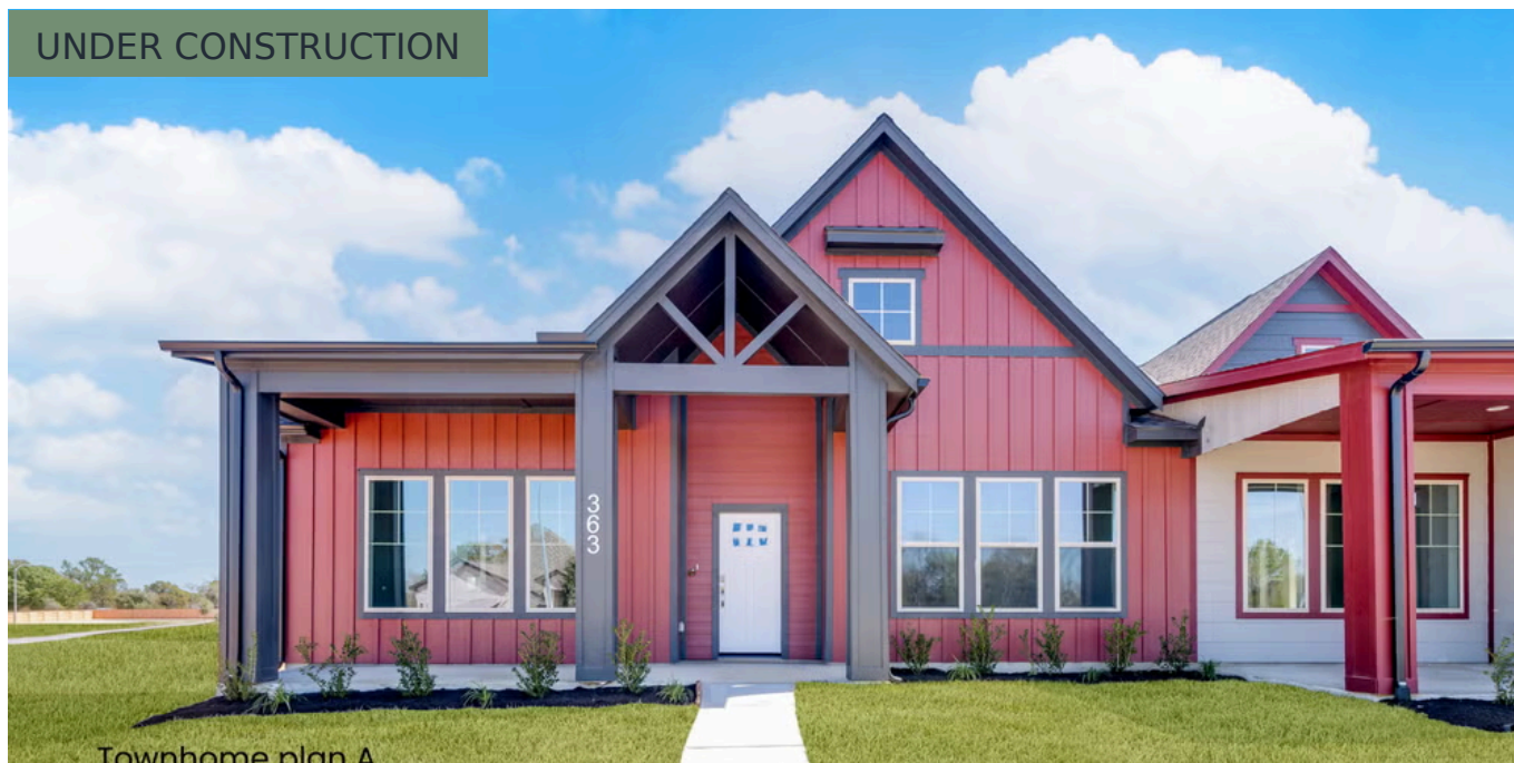
Townhome plan A