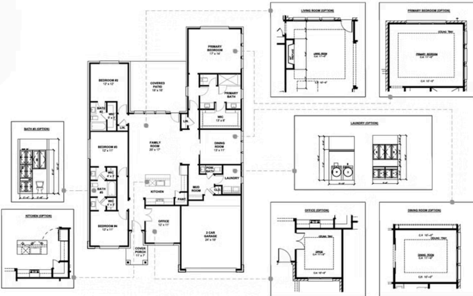
2517 Elevation C

All square footage is approximate. Renderings are artist's conceptions and may vary slightly from the actual home. Homes may be built in reverse of plans shown, depending on site conditions. Minor architectural changes may be made occasionally at the option of the builder. Please contact your Sales Consultant for details.