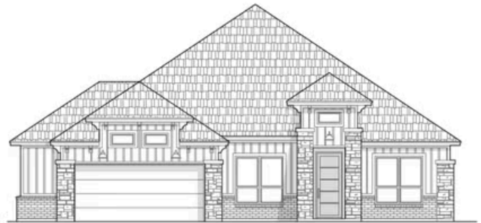
Elevation B with Garage Extension

All square footage is approximate. Renderings are artist's conceptions and may vary slightly from the actual home. Homes may be built in reverse of plans shown, depending on site conditions. Minor architectural changes may be made occasionally at the option of the builder. Please contact your Sales Consultant for details.