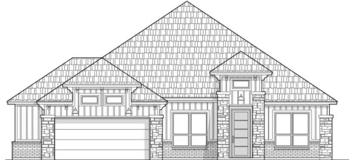
Elevation B with Garage Extension

All square footage is approximate. Renderings are artist's conceptions and may vary slightly from the actual home. Homes may be built in reverse of plans shown, depending on site conditions. Minor architectural changes may be made occasionally at the option of the builder. Please contact your Sales Consultant for details.