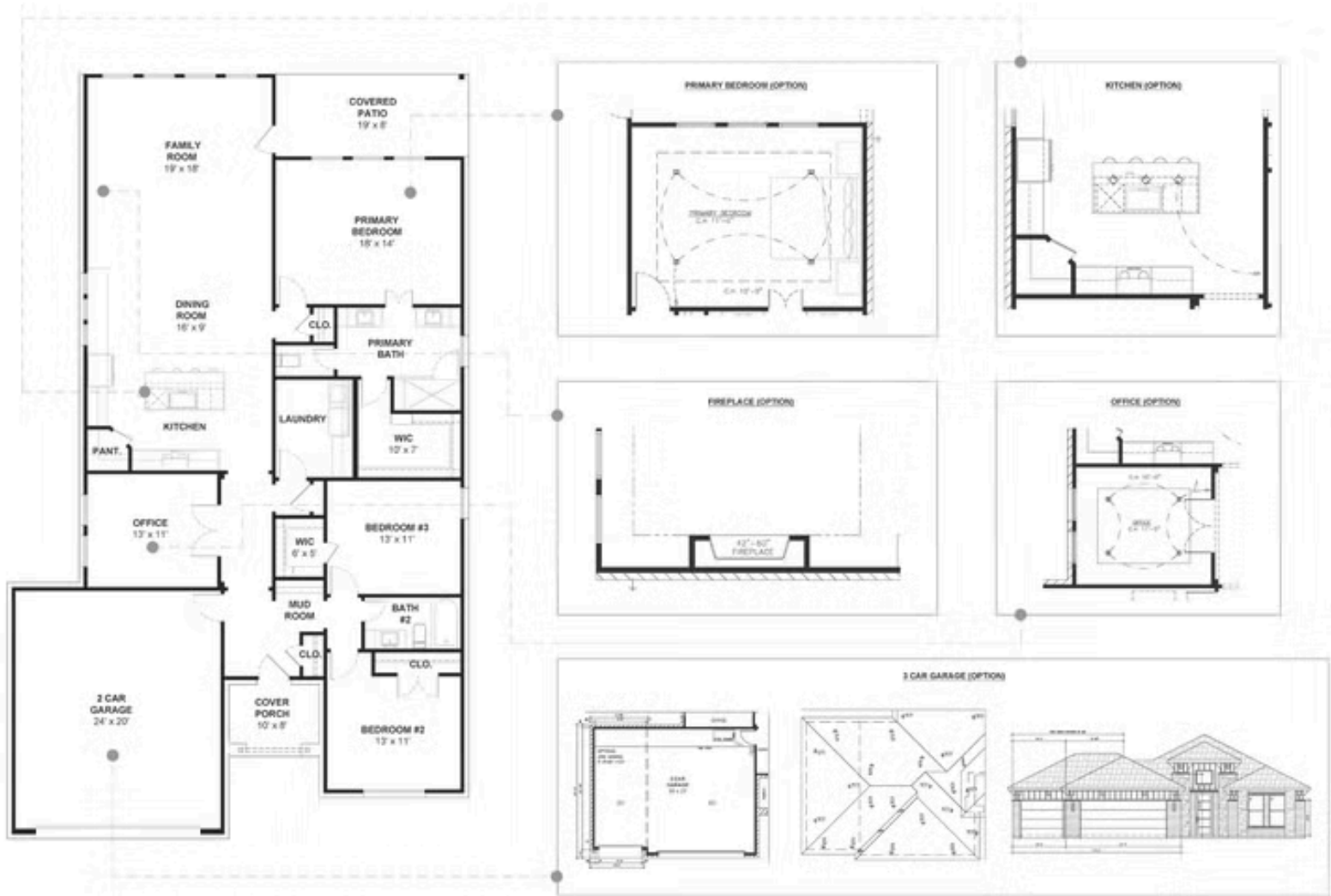
2132 Elevation B

All square footage is approximate. Renderings are artist's conceptions and may vary slightly from the actual home. Homes may be built in reverse of plans shown, depending on site conditions. Minor architectural changes may be made occasionally at the option of the builder. Please contact your Sales Consultant for details.